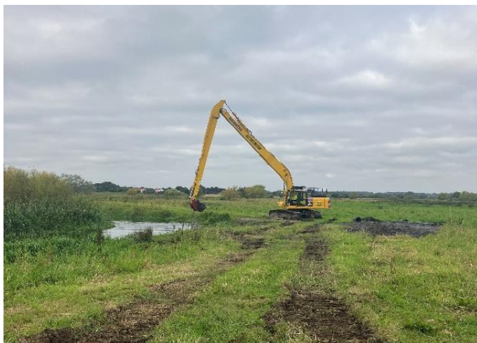
Figure above: Excavator de-silting the River Idle at Stone Hill Farm

The works are carried out by an operative in an excavator which has a de-silt bucket attached. The silt is removed down to riverbed level and is spread next to the machine. Special considerations are taken when removing the silt to ensure that environmental risks are mitigated.