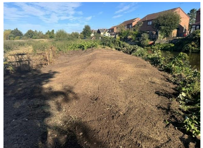
Figure above: High ground top up along the River Idle

A 'low' spot along a high ground section of the Idle along Darrel Road, Retford, has been topped up. The work completed has raised the level of the 'low' spot, topping up the high ground with soil and spreading grass seed to promote growth. Although the high ground is not a flood defence, the aim of the work is to encourage water to stay in the river channel.