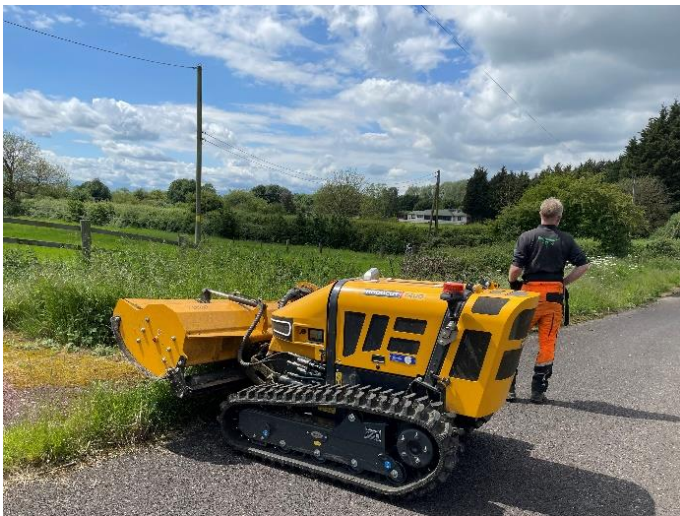
Figure above: Grass cutting via Robot Mower

All grass cuts by machinery and by hand along the River Idle embankments have been completed. Regular grass cuts improve the strength of the root network and erosion resistance of the embankment.